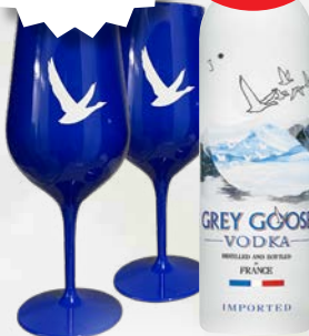
GREY GOOSE VODKA 700ML