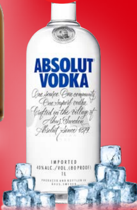
ABSOLUT VODKA 1 LITRE