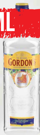
GORDON'S GIN 700ML