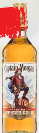
CAPTAIN MORGAN SPICED RUM 700ML