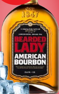
BEARDED LADY BOURBON 1 LITRE