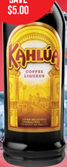
KAHLUA 1 LITRE