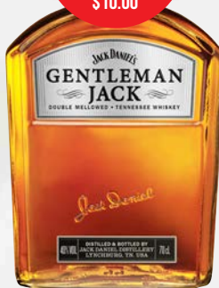
GENTLEMAN JACK 700ML