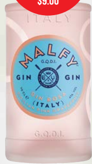
MALFY ROSA GIN 700ML ORIGINAL & CON LIMONE