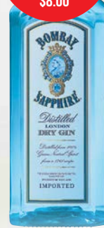
BOMBAY SAPPHIRE GIN 700ML