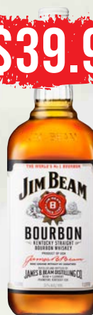
JIM BEAM WHITE 700ML