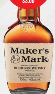
MAKER'S MARK 700ML