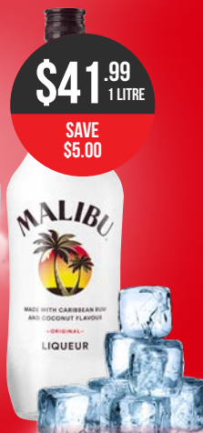
MALIBU 1 LITRE