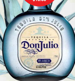
DON JULIO BLANCO 700ML