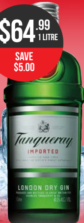
TANQUERAY GIN 1 LITRE