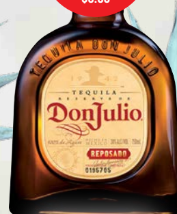
DON JULIO REPOSADO 700ML