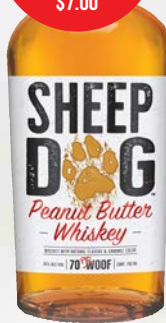
SHEEP DOG PEANUT BUTTER WHISKEY 700ML