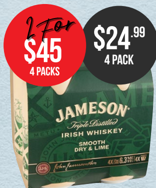
Jameson 6.3% 4 Packs