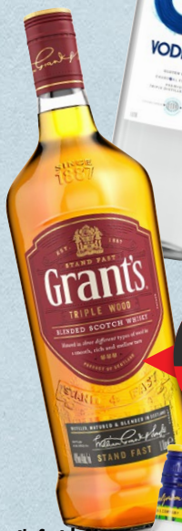
Grant's Scotch 1L RRP $61.99