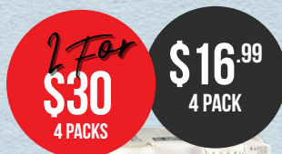
Jameson 6.3% 4 Packs