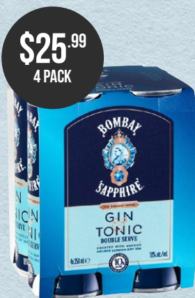
Bombay Double Serve 4 Packs