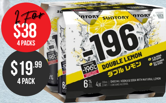
196 Double Lemon 4 Pack