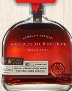
Woodford Double Oaked RRP $79.99