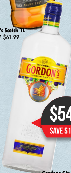
Gordon's Gin 1L RRP $65.99