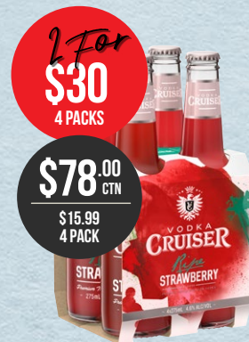
Vodka Cruiser 4 Packs