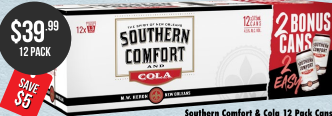
Southern Comfort & Cola 12 Pack Cans