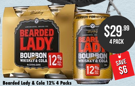
Bearded Lady & Cola 12% 4 Packs