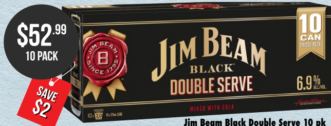
Jim Beam Black Double Serve 10 pk