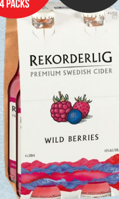
Rekorderlig 4 Packs