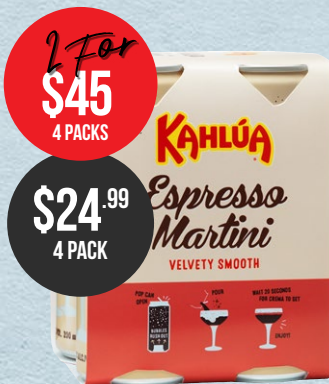
Kahlua Espresso Martini 4 Packs