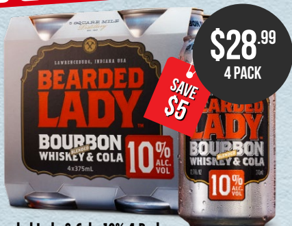
Bearded Lady & Cola 10% 4 Packs