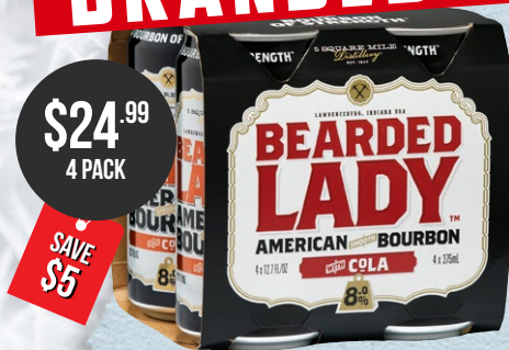
Bearded Lady & Cola 8% 4 Packs