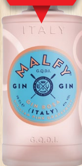
Malfy Gin & Varieties RRP $68.99