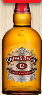
Chivas Regal RRP $56.99