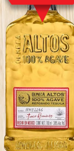
Olmeca Altos Reposado Tequila RRP $69.99