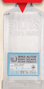
Olmeca Altos Plata Tequila RRP $64.99