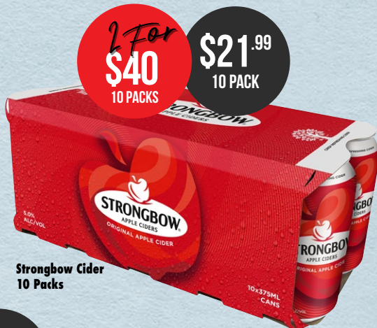
Strongbow Cider 10 Packs