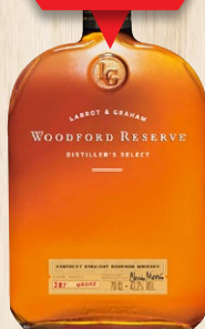
Woodford Reserve RRP $66.99