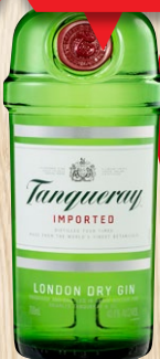
Tanqueray Gin RRP $52.99