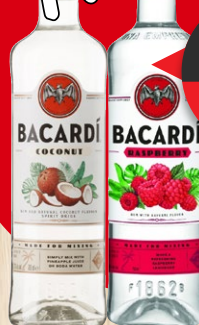
Bacardi Flavours RRP $47.99