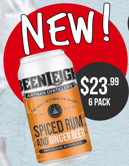
Beenleigh Spiced Rum & Ginger Beer 6 Packs