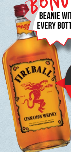
Fireball Whisky 1L RRP $69.99