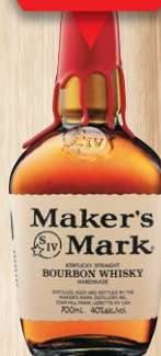
Maker's Mark RRP $54.99