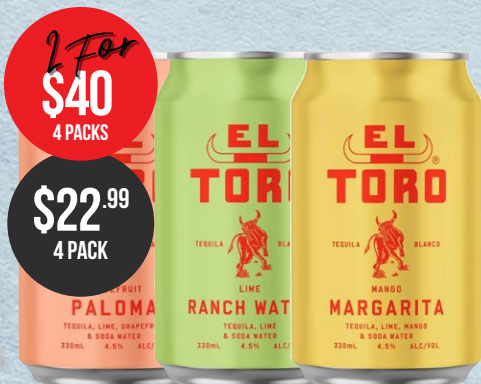
El Toro RTD 4 Packs